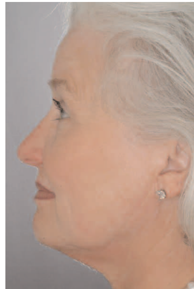
Figure 2: Post-treatment

Candela Corporation 530 Boston Post Road Wayland, MA 01778 USA Phone: (508) 358-7637 Fax: (508) 358-5569 Toll Free: (800) 821-2013 www.candelalaser.com