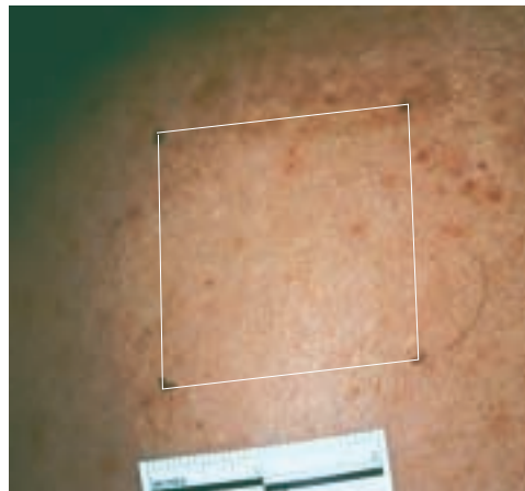
Treatment Parameters: 16 J/cm 2 , DCD 50 ms